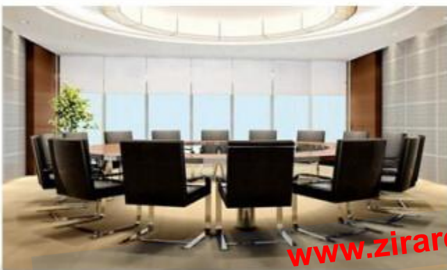
For meeting room