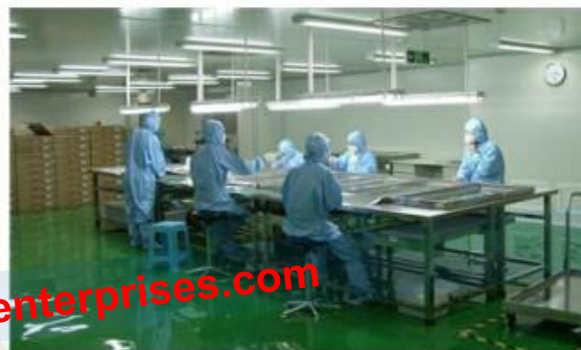
For clean room