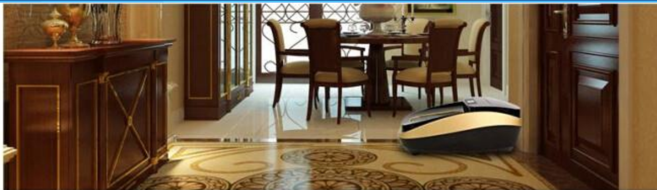
For home、real estate